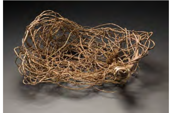
Picture of a woven basket from Bundjalung Country

The OCHRE evaluation highlights the importance of government co-designing and co-producing services, policy and evaluation with communities. With regard to co-design, NCARA believes that there has to be a stronger embrace of interweaving evaluation, research, policy, programming and service delivery. At this point in time, we believe that these threads are disjointed, frayed, too loose, and too often culturally biased.